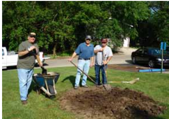
Clean Up Day at the Post

Thanks to the Crazy Eights at Kennedy Jr. High School for all their help with the flower sale and with planting the grounds. These kids arrive with tremendous energy and enthusiasm and really work hard. Thanks also to the Boy Scout Troop 111 who helped us on Saturday. Thanks also to the members who showed up to help. The Post is looking fabulous!