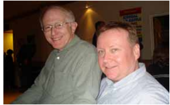
The Fish Fries were so popular, some people even had to share their chairs.

There are many others that came out to help and it is very much appreciated. Your efforts truly make a difference!